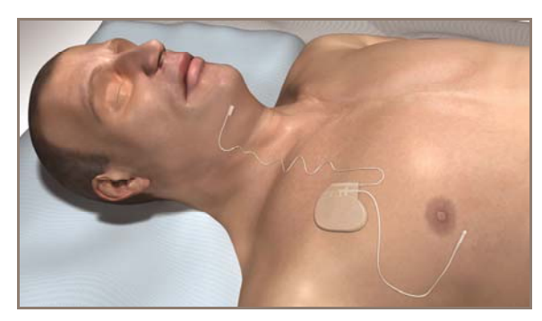
Inspire therapy senses breathing patterns and delivers mild stimulation to key airway muscles, which keeps the airway open during sleep.

Safety information for Inspire therapy is provided at www.InspireBetterSleep.com. Information at this site should not be used as a substitute for patients talking with their doctor. Patients are encouraged to review this safety information and talk with their doctor about diagnosis and treatment options.